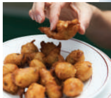
Accras (codfish fritters)

What is Martinican cuisine? In fact, there are two types: French and Creole.