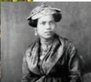
Creole traditional outfit

The north is a rugged mountainous region featuring the active volcano Mount Pelée and the Pitons du Carbet range, swathed in rainforest. The north also boasts beaches with silver or bluish-gray volcanic sand. The center of the island is home to Martinique's largest mangroves. The roots of the trees aren't underground, but out in the open air, thus the nickname "forests taking a foot bath." The south features rocky hills, valleys, and fjord-like coves, plus white-sand beaches and rocky promontories. Before any French or African pioneers arrived, there were Amerindian ethnic groups from South America, followed by the Arawaks, who were later supplanted by the Caribs.