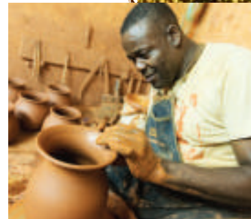
Traditional pottery arts