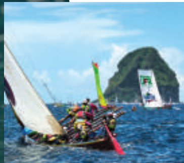
Yole boat race