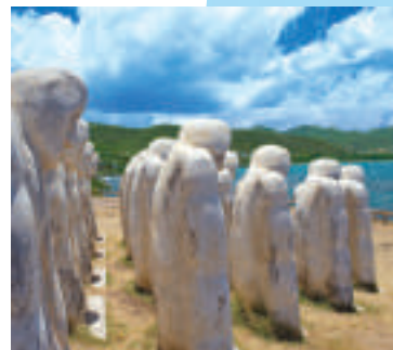
Anse Cafard Slave Memorial