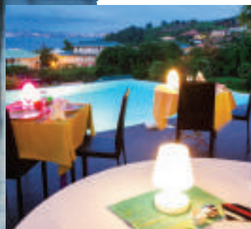
Les Trois Ilets

When planning a honeymoon or a romantic vacation, it can be hard to settle on a destination.