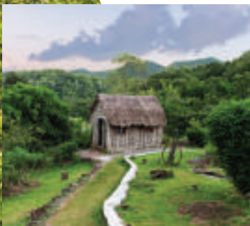
The Slave Savannah