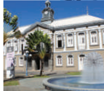
Aimé Césaire Theater

Visitors can also explore Martinique's rich history and cultural heritage through an extensive network of museums scattered throughout the island and a more recent multi-artist installation of totem poles in the city of Saint-Pierre.