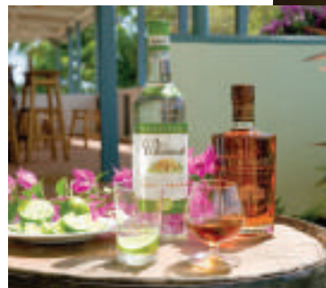
Rhum Agricole from Martinique

Just as wine lovers visit France to savor the best of French wine while traveling along La Route des Vins , rum connoisseurs head to Martinique to experience some of the world's finest rums by traveling La Route des Grands Rhums .